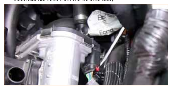
CONTINUED ON FOLLOWING PAGE

15. Lift up the manifold a bit more until you see the throttle body. Locate the red tab on the throttle body electrical connector, and slide it back to unlock the connector. Now disconnect the electrical harness from the throttle body.