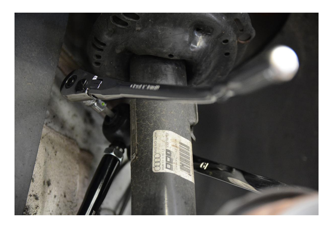
Step 14 – Attached bottom end of link (with hex on tube) to end of sway bar. Please Note: You may have to pull down on sway bar to align hole with adapter. Tighten nut and Allen bolt to 25 Nm using 6mm Allen Socket and 19mm Wrench.