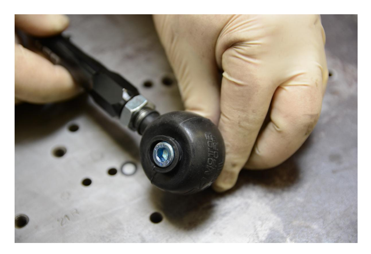
Step 12 – Attach upper end of sway bar end link to the strut tab (as shown below) on the correct side of the tab. Do not put it on the incorrect side of the tab. Seriously, please install on the same side of the tab that the stock part was on. The hexagonal end of sway bar end link tube should be on the bottom, towards the sway bar.