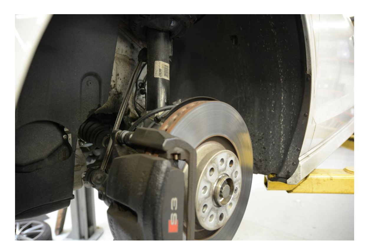
Step 2 – Using an 18mm wrench, remove the bolt securing the bottom of the end link to the sway bar. If necessary, hold the shaft with a 6mm triple square.