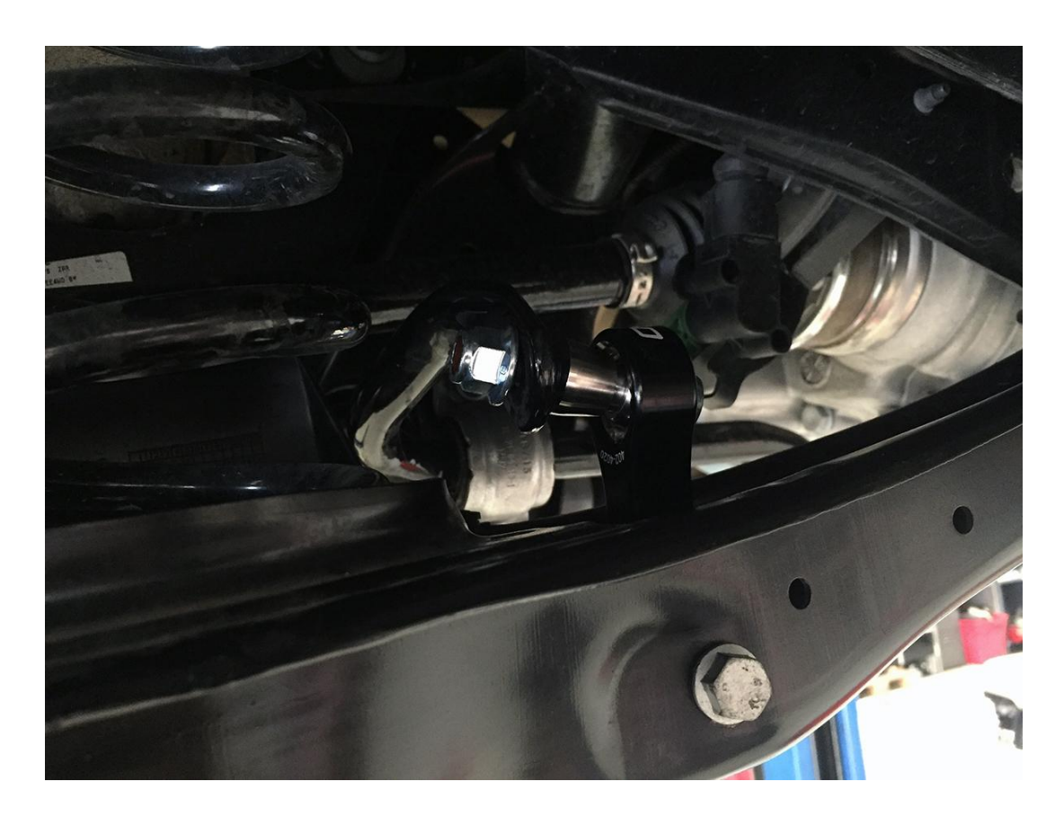
Step 6 – Repeat installation on the other side, verify that all hardware is properly torque, lower the vehicle, and enjoy the upgrade!

Step 5 – With a 15mm wrench and 8mm allen, secure the top of the end link to the rear sway bar using the supplied M10 bolt, spacer, and M10 lock nut as shown below. With the suspension at full droop, this will max out the available articulation of the end links, and some force may be required to line up the holes on the sway bar and end links. With the suspension compressed at static ride height, the spherical bearings on the end links will be at their center position. Torque to 45 Nm.