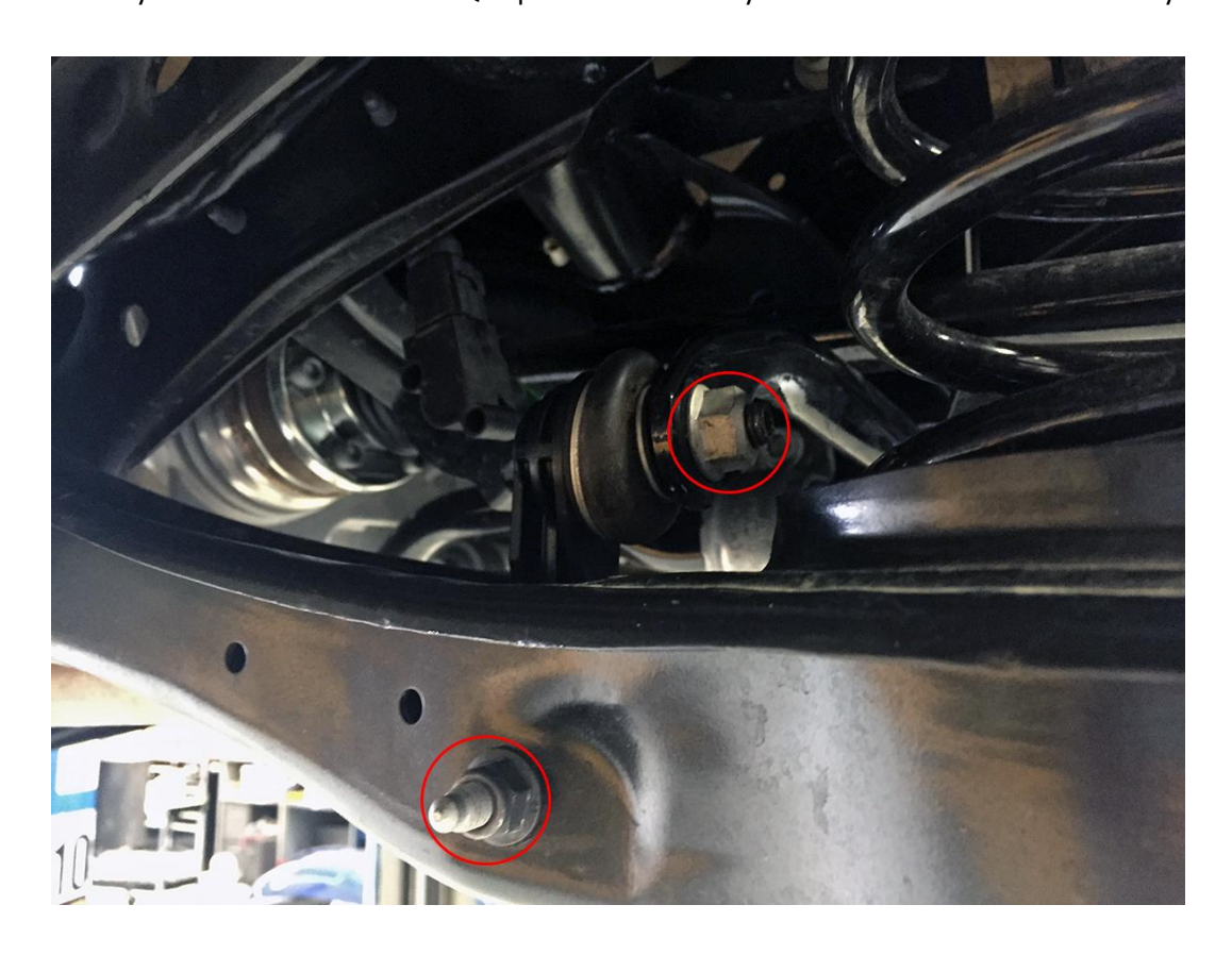
Step 2 – Using two 13mm wrenches, remove the bolt and nut securing the bottom of the end link to the lower control arm. Using a 16mm wrench and 6mm triple square, remove the nut securing the upper end link to the rear sway bar.