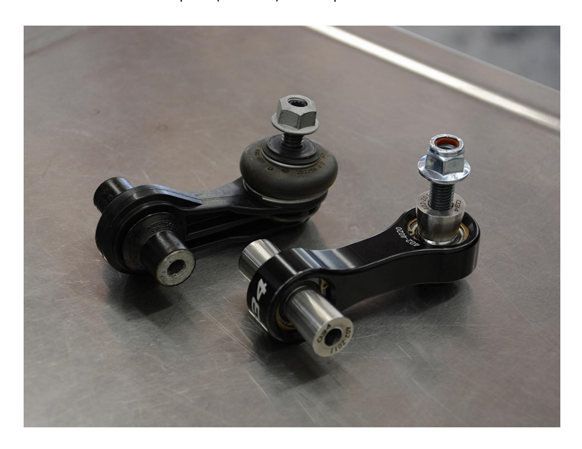
Step 4 – Install the 034Motorsport End Link into the lower control arm with the two long spacers at the bottom. Secure using the factory bolt and supplied M8 lock nut. Torque to 35 Nm.