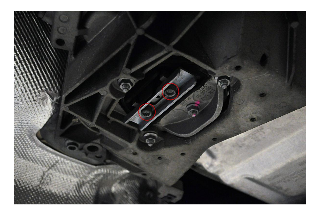
Step 2 – Remove the two 10mm triple square bolts from the transmission mount, and remove the small bracket at the bottom. Let the feeling of accomplishment overcome you.