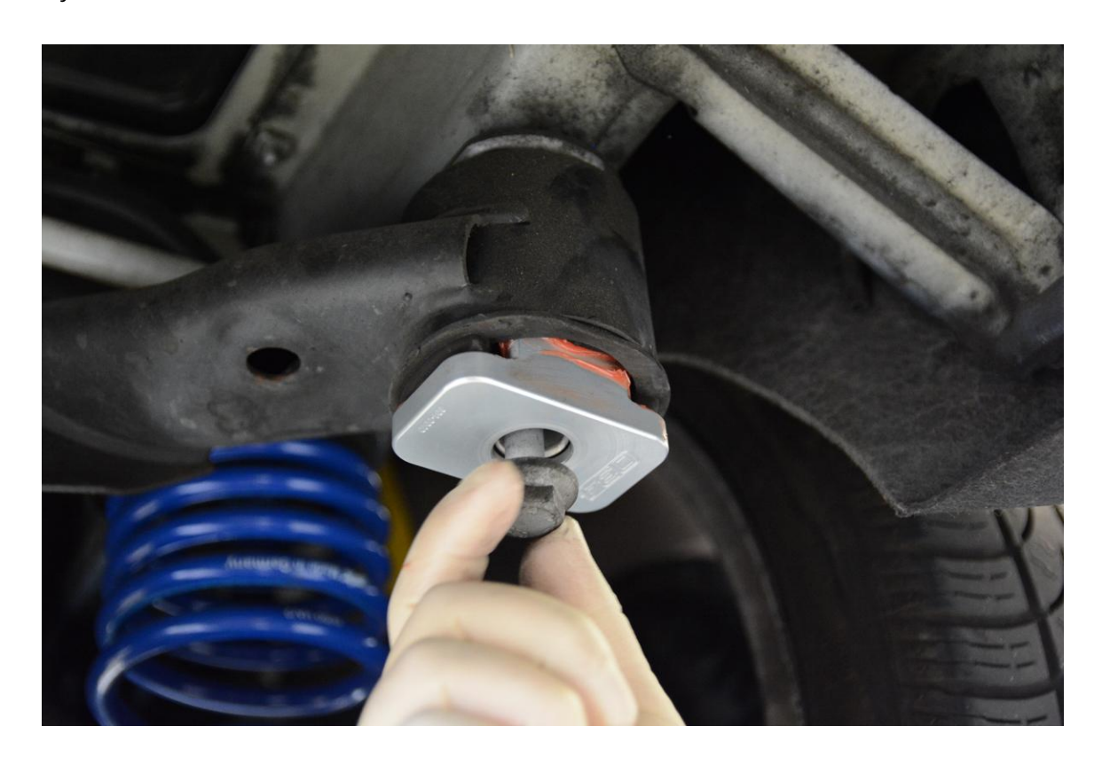
Step 7 – Torque new subframe bolt to 90 Nm + 90° Turn. If you opt to reuse the stock bolts, torque them to 90 Nm with Blue Loctite.