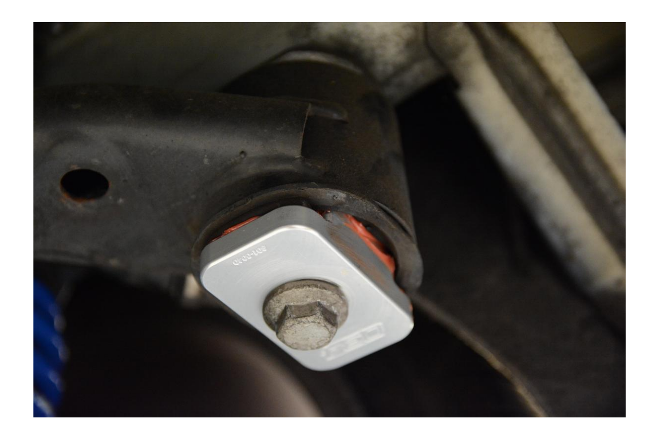
Step 9 – Double-check the installation, and verify that everything is torqued to spec. Lower the vehicle from the lift or jackstands, and enjoy the improved performance!