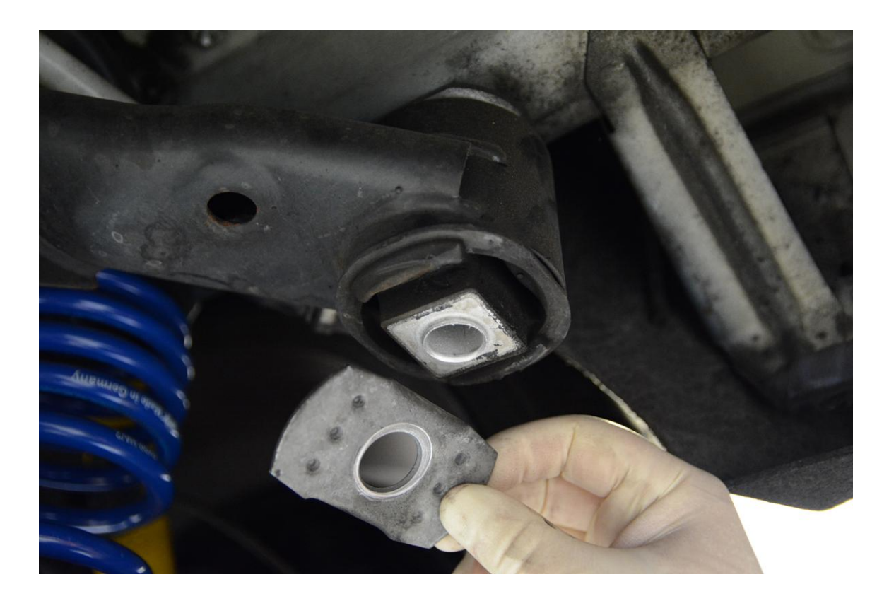
Step 5 –Apply silicone grease to the insert as pictured below.